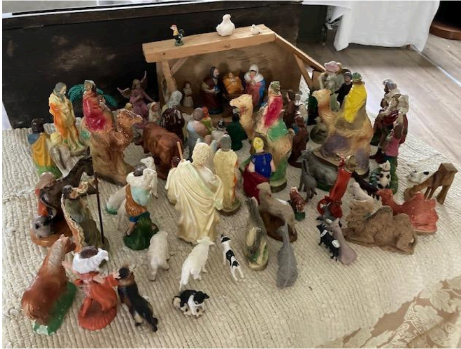
Nativity scene from Christmas Open house