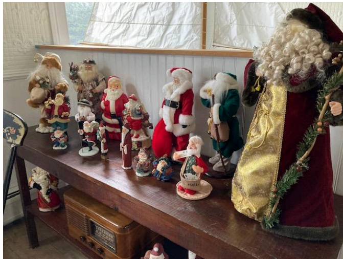
Displays from our Christmas Open house